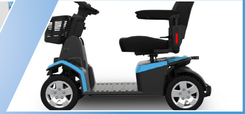
Comfortabele dubbele vering