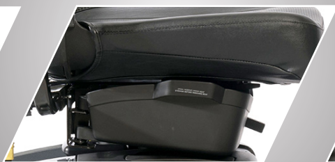
Opbergruimte onder de stoel